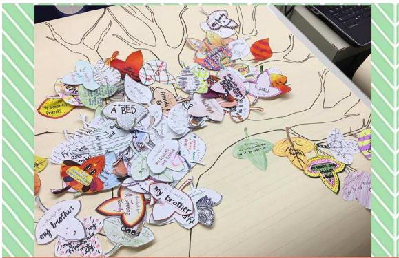
Step 3: Outline your tree & assemble & glue leaves