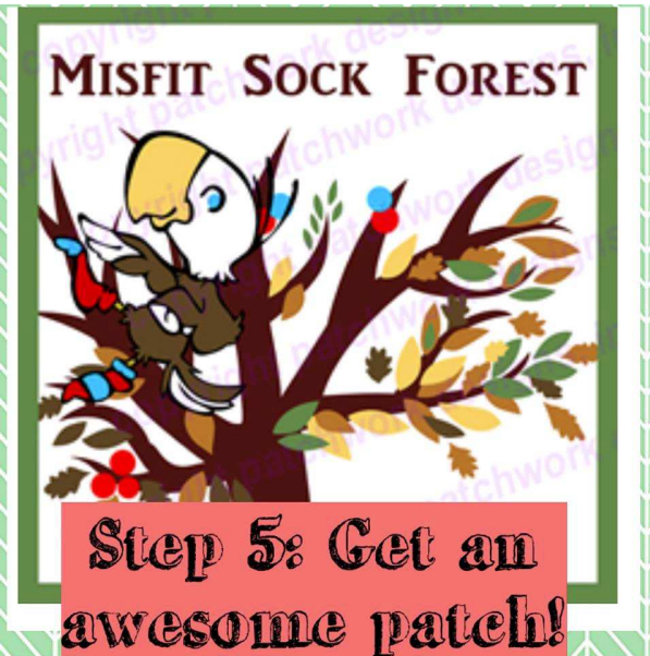
Step 5: Get an awesome patch!