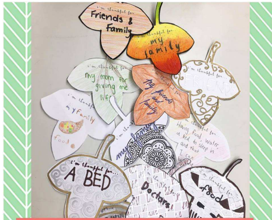
Step 2: Print, cut & decorate your leaves