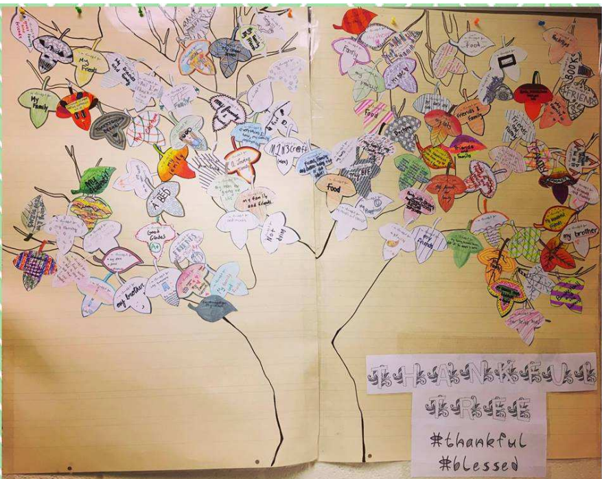
Step 4: Put finishing touches & hang it up!