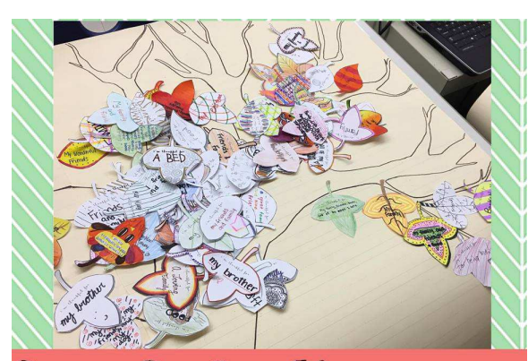
Step 3: Outline your tree & assemble & glue leaves