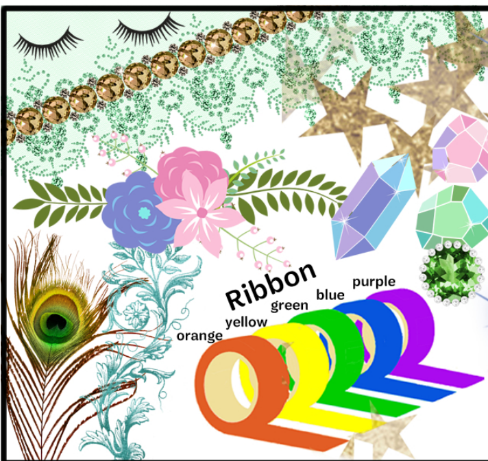
Taja's Craft Box