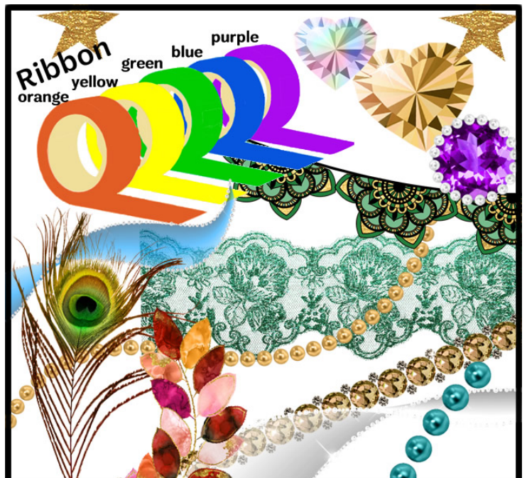
Nina's Craft Box