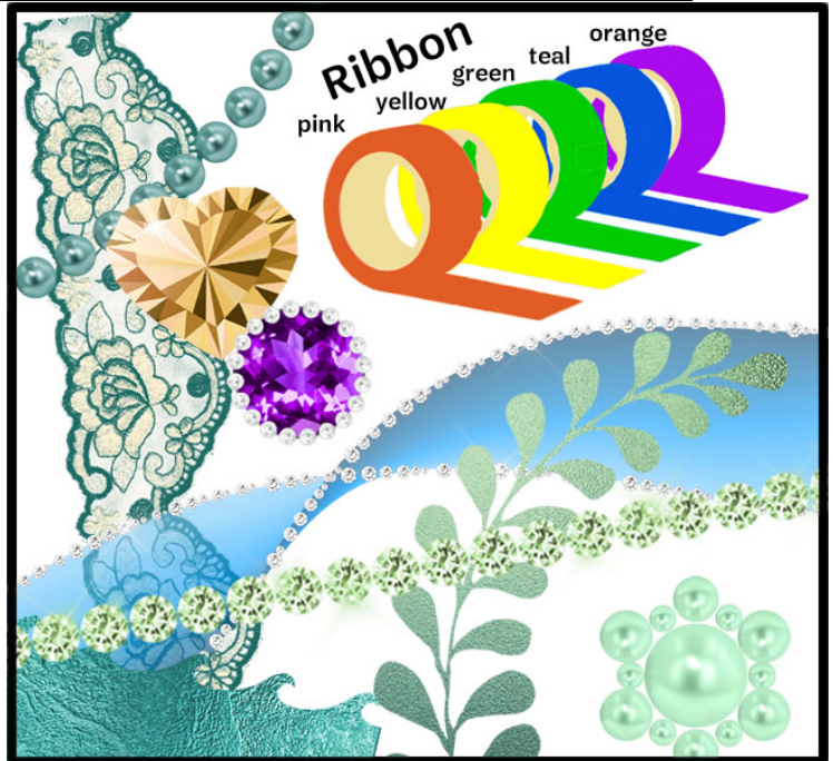
Gracie's Craft Box