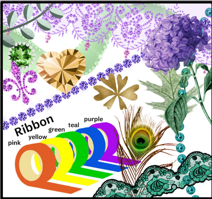
Khylie's Craft Box